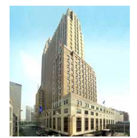
Hilton Cincinnati Netherland Plaza